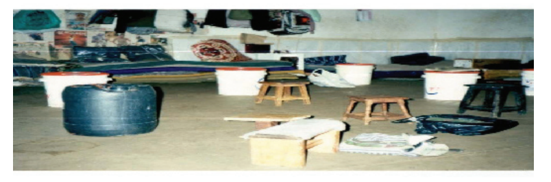
Figure 4: Sitting Facilities

Sitting facilities used by learners in Kamiti Maximum prisons